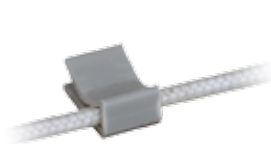
J-clips 10 for WLD cable