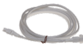
Water leak extension 2 m