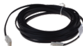
WLD A prolong cable 5 m